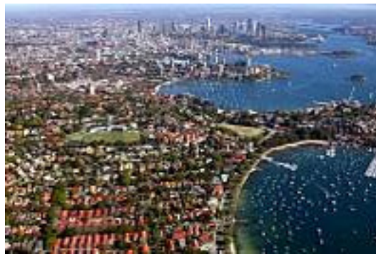
Rose Bay looking WEST

As outlined the relocation plan provides several options for existing mooring tenants.